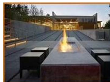
Novelty Hill - Januik Winery

Join us for a fun and informative tour of Woodinville's burgeoning wine country.