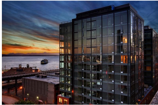
The Post at Pier 52

Please join ULI Northwest for an enjoyable summer evening at The Post at Pier 52 . This casual event will take place at one of Seattle's newest apartment developments on the edge of downtown and Pioneer Square. We'll provide the food and libation; you enjoy the relaxing atmosphere and informal networking with ULI members and sponsors.