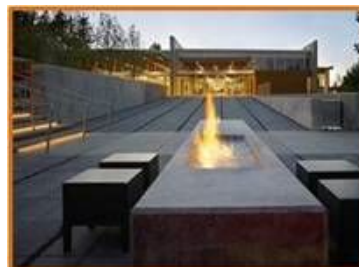
Novelty Hill - Januik Winery

Woodinville is a growing city on the urban edge of East King County. Its location, along with an economic development niche in wine tourism gives it a unique place in the region's economy. Recently, Woodinville has been in the news for some contentious land use issues that center on how it can grow its tourism economy within its urban areas without compromising the semi-rural character around its edges. This tour will be a fun way to experience what makes Woodinville unique by way of sampling some local food and wine and hearing from some of the local purveyors - with real estate and land use as underlying themes.